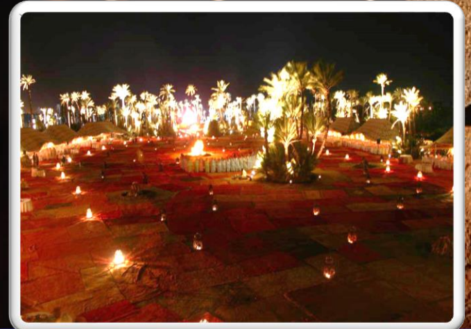
Convention GBS Summit Novo - Palmeraie Golf Palace - Marrakech – 600 Pax May 2010