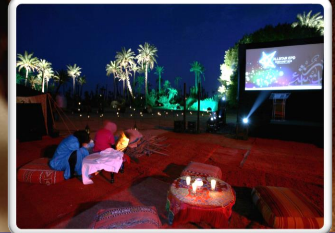
Convention ABBOTT ALL STARS EMEA - Marrakech - 100 Pax – April 2013