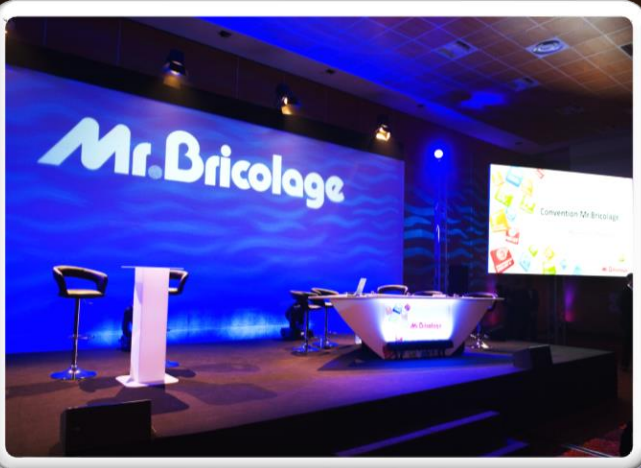
Convention Mr. Bricolage – Palmeraie Golf Palace - Marrakech - 300 Pax – February 2013