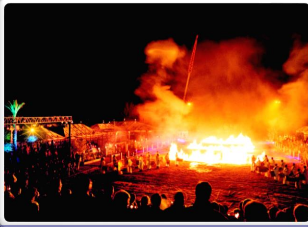
Launch New Renault Laguna - Gala dinner Borj Bladi Marrakech - 4.500 Pax - December 2000