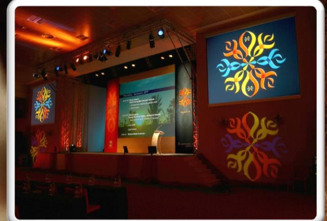
Convention SONY Europe – Sofitel Marrakech 220 Pax – October 2007