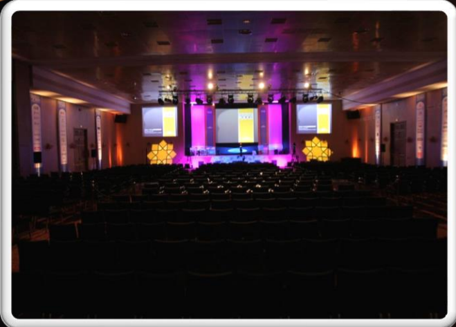
Convention Point P Partenaires – Palmeraie Golf Palace - Marrakech 750 Pax – May 2008