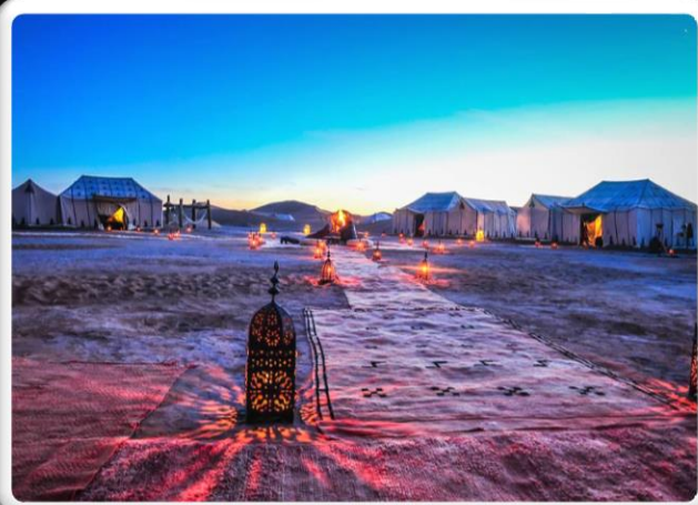
Intel Europe – Merzouga sand hills – 250 Pax Luxury Desert Camp - April 2005