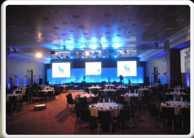
BAAGI Premix Summit Novo Nordisk - Palmeraie Golf Palace - Marrakech - 350 Pax - April 2012