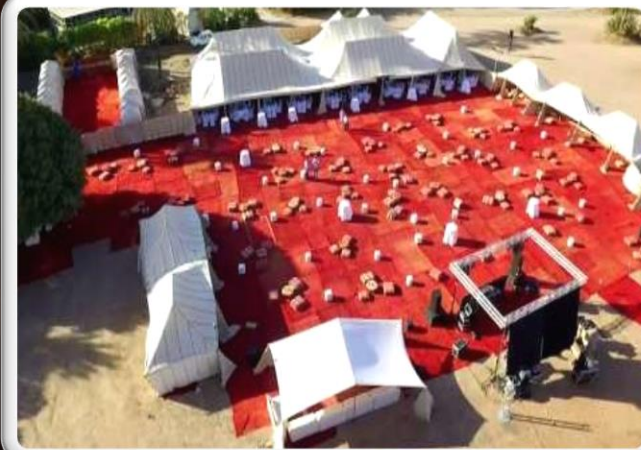
Colosseum Convention – Hotel Du Golf 350 Pax - October 2017