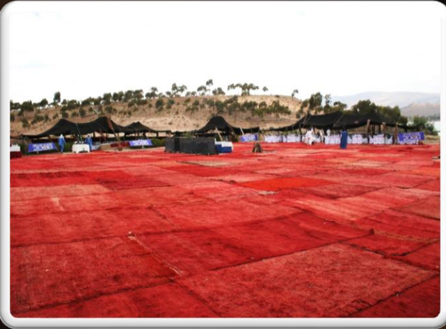
Convention Point P Partenaires – Palmeraie Golf Palace - Marrakech 750 Pax – May 2008