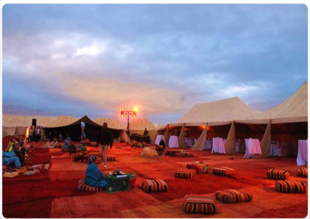
Incentive Danone Waters – Sofitel Marrakech – Luxury desert camp -- 150 Pax – March 2015