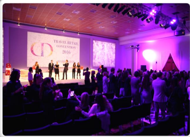
Dior Travel Retail Convention – Palmeraie Resorts – 500 Pax - February 2016