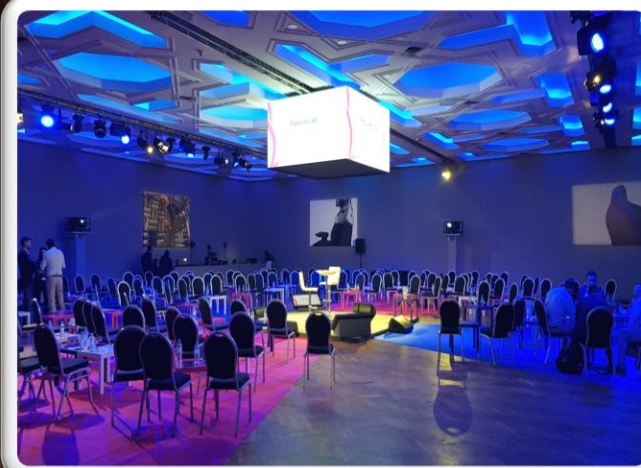
Faurecia Convention – Hotel Sofitel Jardin des Roses – 150 Pax - February 2019