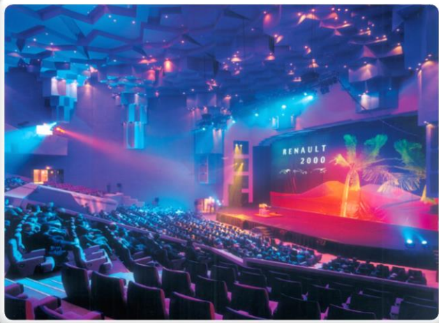
Launch New Renault Laguna – Marrakech Congress Center - 4.500 Pax – December 2000