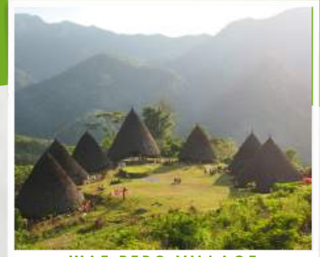
WAE REBO VILLAGE